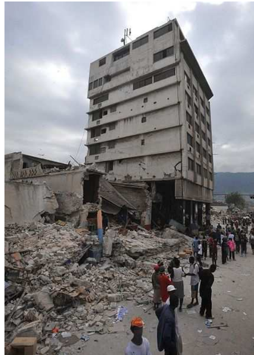
Damaged buildings in the Port-au-Prince neighbourhood of Bel-Air, after the 2010 Haiti earthquake. The tall block remains standing amid the ruins of lower, less well-constructed buildings.

Ask the pupils to suggest what relevance this demonstration has in the real world. Most will suggest that the model is showing what happens to buildings when they are affected by an earthquake. No doubt, pupils will relate their observations to images seen on T.V., filmed during a recent earthquake.