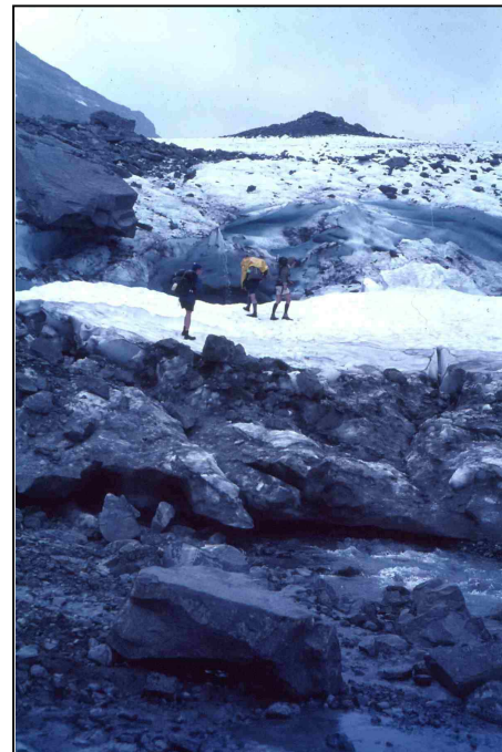
Meltwater emerging from the bed of a glacier in Norway.