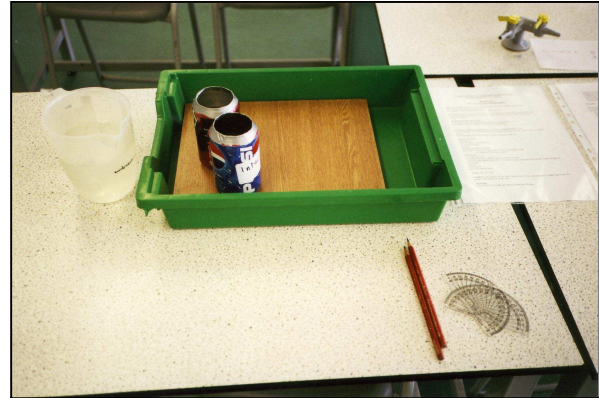
The apparatus ready for use. (It is worth having a beaker of water ready, rather than waiting for the can to fill up under the tap).