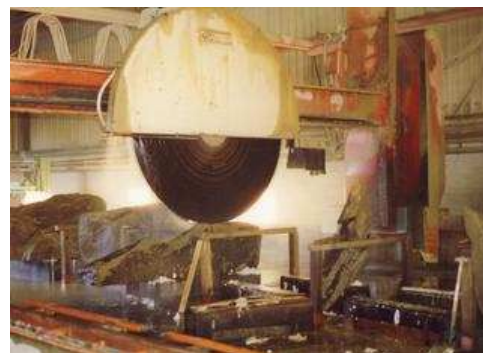
A 3m diameter rock saw cutting sandstone into uniform slabs (Johnsons Wellfield, Huddersfield.)