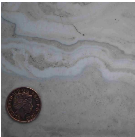
Travertine mineral spring-limestone (Pleistocene), Italy