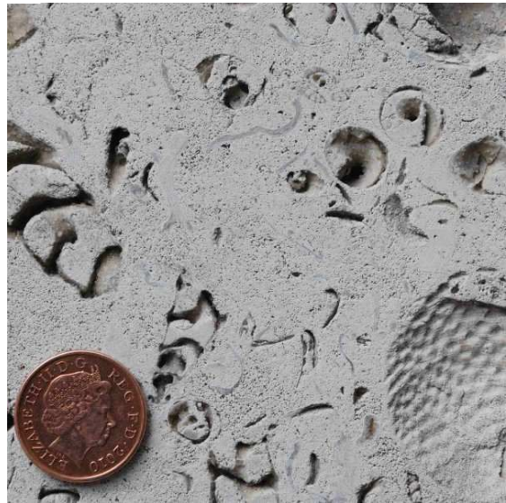
Roach Rock (Jurassic Limestone), Isle of Portland, England