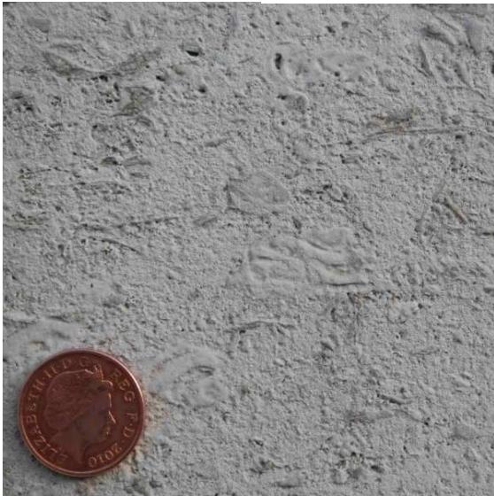
Portland Limestone (Jurassic), Isle of Portland, England