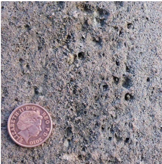
Ancaster Limestone (Jurassic), Lincolnshire