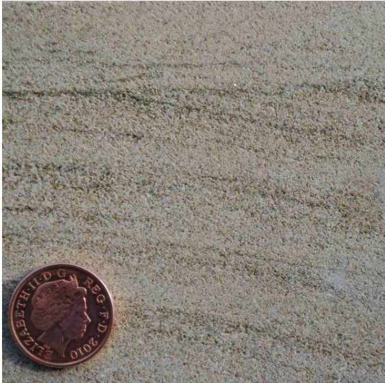
Cross-bedded sandstone (Carboniferous), Stanton Moor, Derbyshire, England