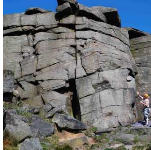
A 'Millstone Grit' coarse sandstone outcrop, Burbage Edge, near Sheffield

Show pupils the photograph of Sheffield Town Hall. The original sandstone blocks were taken from a quarry and the newer stonework in the foreground, was taken from the same quarry a century later. Ask them what problems might occur in trying to match new building stones with older stonework.