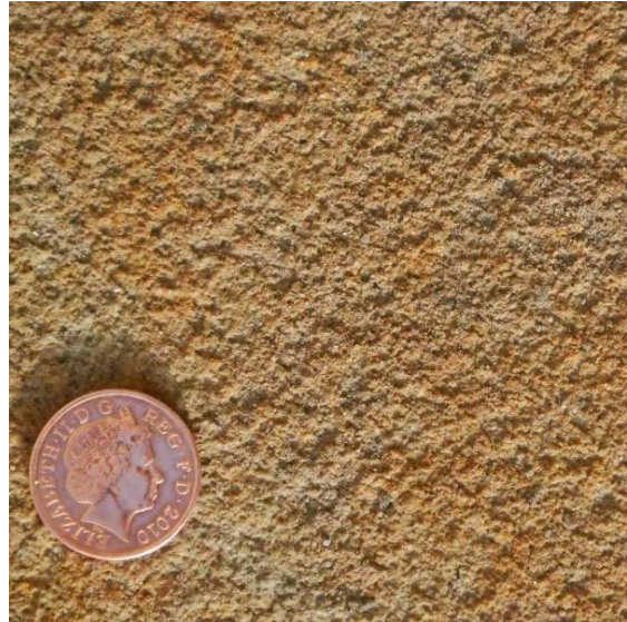
"Rockingstone", shot sawn sandstone, (Carboniferous), Huddersfield, England