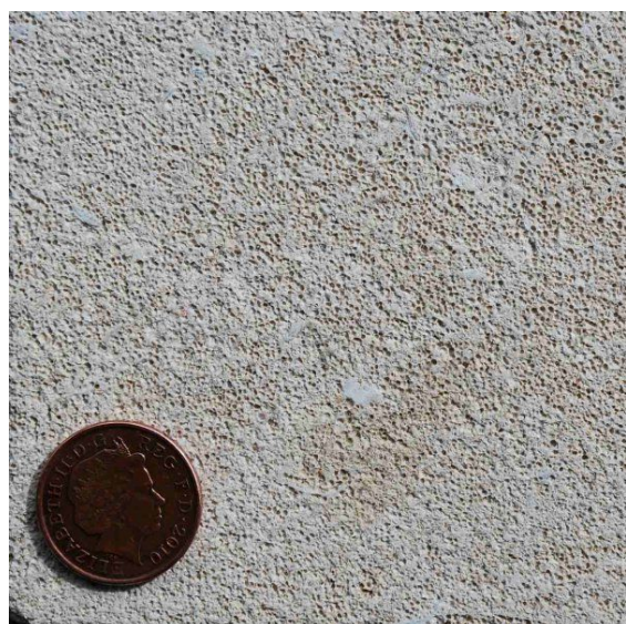
Bath Stone Limestone ('Stoke Ground, Top Bed', Jurassic), Bath, England