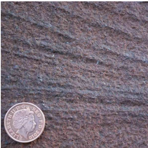
St Bees Sandstone (Triassic), Cumbria, England