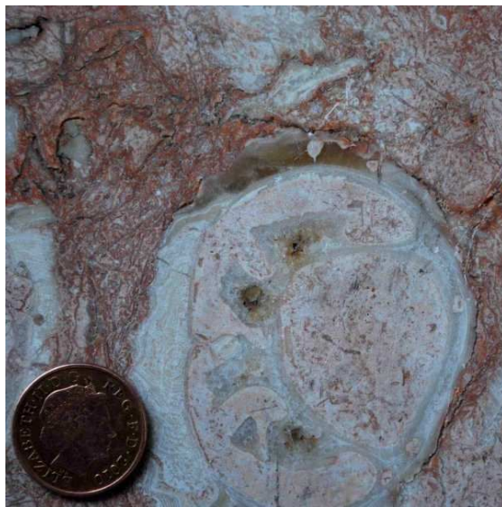
Rudistid limestone (Cretaceous), probably Portugal