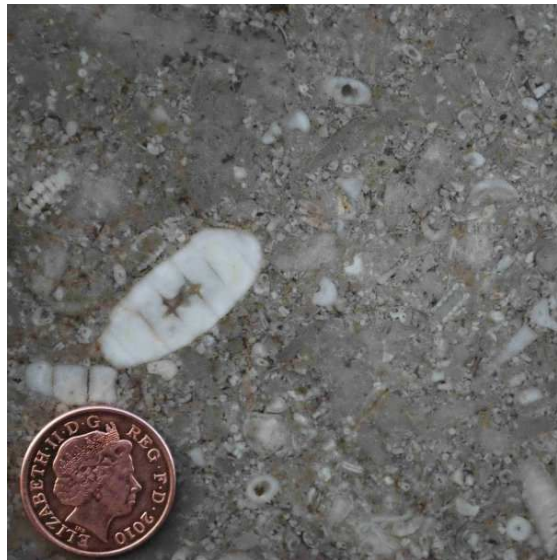
Crinoidal Limestone (Carboniferous), Derbyshire, England