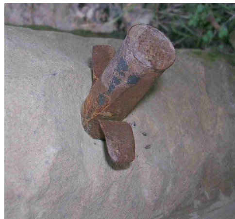
Plug and feathers, Hardwick Hall, Derbyshire