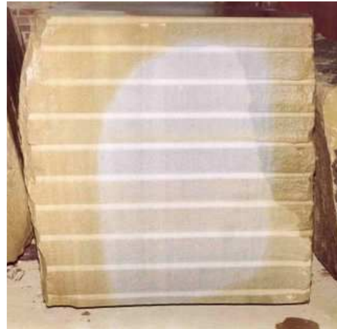
Drill holes in a block of sandstone, used in splitting the block from a larger mass, using 'plug and feathers' (The brown colour round the edges shows where weathering has oxidised the iron minerals in the rock). (Johnsons Wellfield, Huddersfield. Photo: Peter Kennett)

works, where a diamond-tipped circular saw, 3m in diameter was used to saw the rock into slabs (photograph). Note that explosives are seldom used in building stone quarries, since this would fracture the rock.