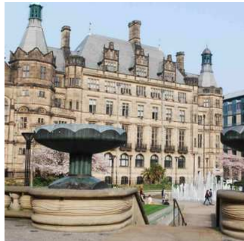
Sheffield Town Hall built in 1897, with new stonework in the foreground from 1999, using sandstone from the same quarry at Stoke Hall in Derbyshire.

Explain that most early gravestones were made of local sedimentary rocks but that most modern gravestones are made of imported rocks, usually igneous or metamorphic ones. Ask why this might be.