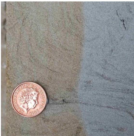
'Yorkstone', (Carboniferous), West Yorkshire, England