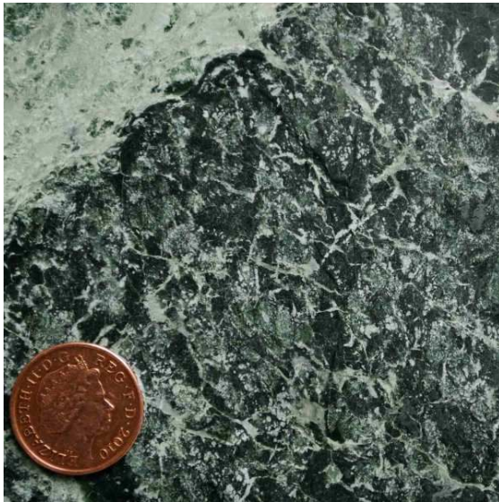
Serpentinite, locality unknown