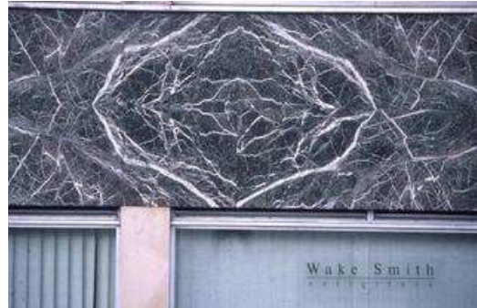
3. Serpentinite used as an ornamental facing stone, (Sheffield)