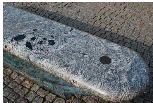
5. A bench seat made of Khuppiam Green gneiss from India (Peace Gardens, Sheffield – a space which is open to the public at all times)