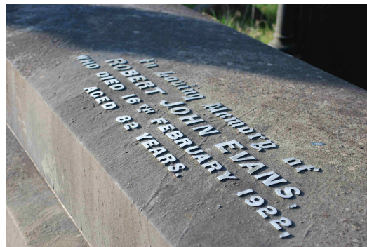
4. A marble grave, with lead lettering, once flush with the surface, now standing out by 2.5mm, Ecclesall Churchyard, Sheffield