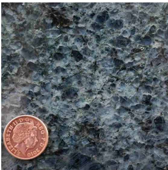
Verde Ematita, Argentina