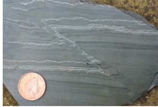
2. Reverse fault in green slate, Lake District. The flat surface on which the penny rests is a natural cleavage plane, (coin is 2cm diameter).