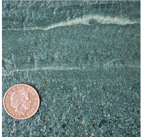
Broughton Moor Slate, Lancashire, England