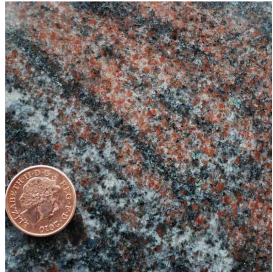
Gneiss, ('Paradiso classico'), India