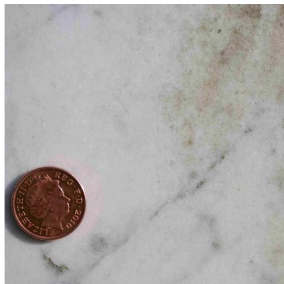
Marble, Carrara, Italy