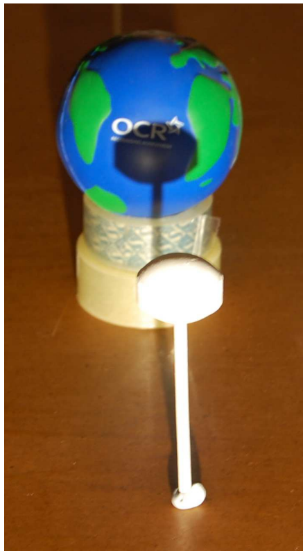
Model eclipse photos: Chris King.

A solar eclipse is seen where the shadow of the 'moon' falls on the Earth, as in the photo below: