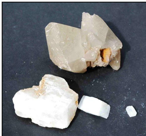
5. Cleavage: well-formed 'dog-tooth' crystals of calcite (top) with cleaved fragments of calcite (bottom)

The photo shows two really good "dog-tooth" crystals of calcite, with some cleavage rhombs lying in front of them.