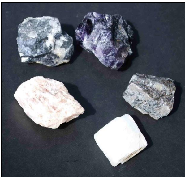
1. A pupil set of five 'unknown' minerals

When the pupils have reported their findings, tell them that we are going to begin to identify the minerals using only those properties that we can see . Another Earthlearningidea activity will use tests which involve handling the specimens.