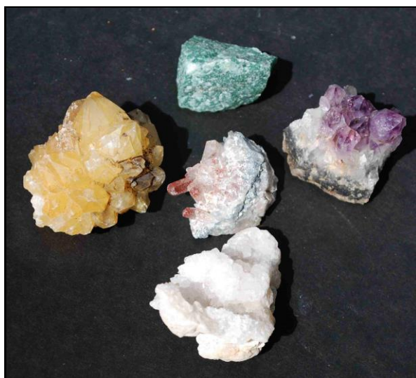
2. Colour: Quartz crystals, showing five different colours

The minerals are all the same, so they probably have the same: hardness, lustre ("shininess"), crystal habit (shape), density.