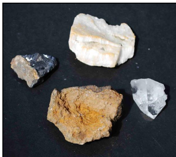
4. Lustre: galena, gypsum, quartz and limonite

Note: Diamond is especially valuable because of its very bright "adamantine" lustre, which makes it sparkle in the light. (You were not given a diamond in this set!)