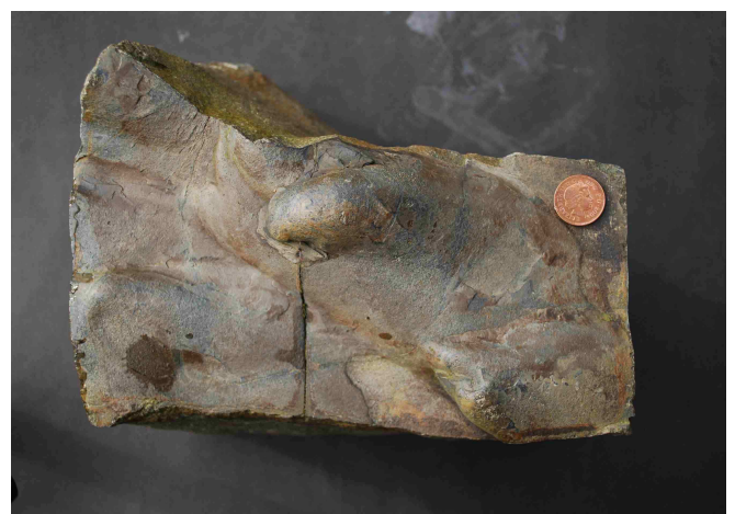
Photo 1. Sole casts, Aberystwyth Grits, Aberystwyth, Wales (coin is 2cm in diameter)

Now ask pupils to study the photographs of sole marks below. In each case, ask them: to name the type of sole marks shown; to work out the trend or direction of the ancient current; and to state if the sample is the right way up, or upside down.