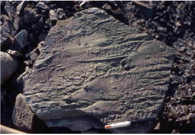
Photo 2. Sole casts, Mam Tor Beds, Mam Tor, Derbyshire