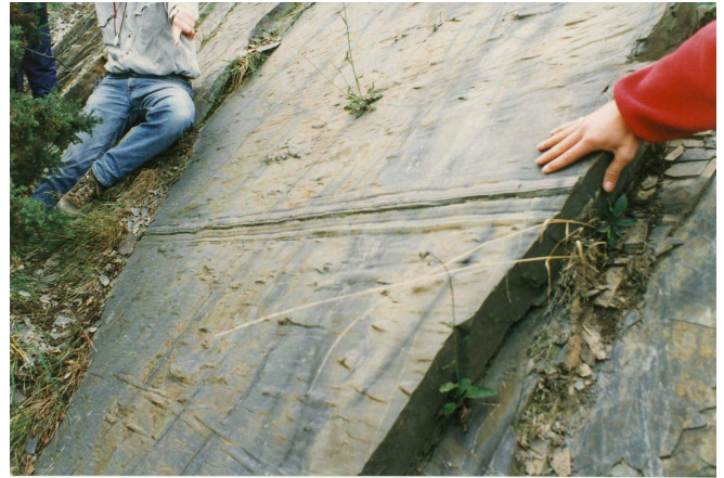
Photo 3. Sole casts, Aberystwyth Grits, Moriah, mid- Wales.