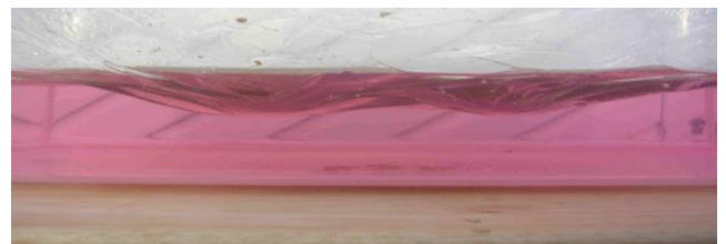
Photo 7: "Load structures" formed as the sand depresses the cling film. (side view)