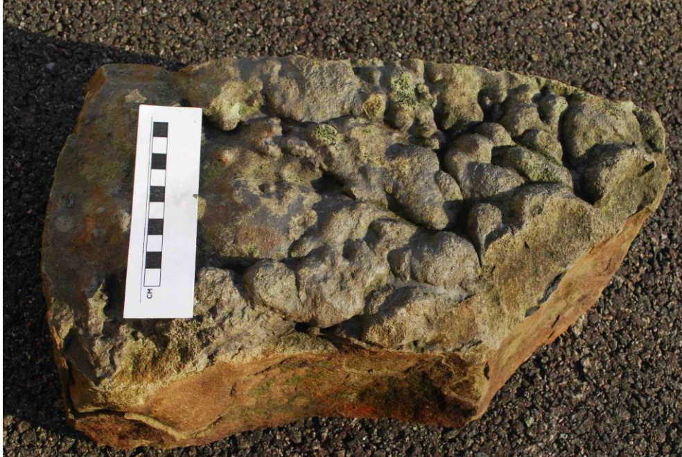
Photo 1. A block of rock for pupils to debate its origin. [Mam Tor Beds, Carboniferous, Derbyshire, England]

the scale on the photograph, and also to ask themselves whether the specimen is the right way up, or if it has been placed upside down. If it is upside down, then they are looking at the base of the specimen.