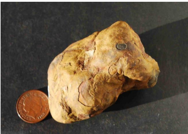
Photo 2: An ironstone nodule from a layer of such nodules lying on a bedding plane. (Coin 2cm) [Pot Clay, Carboniferous, near Sheffield, England]

When they have debated their own ideas, pupils can be shown Photographs 2 to 5, to see if any of these help in explaining the features.