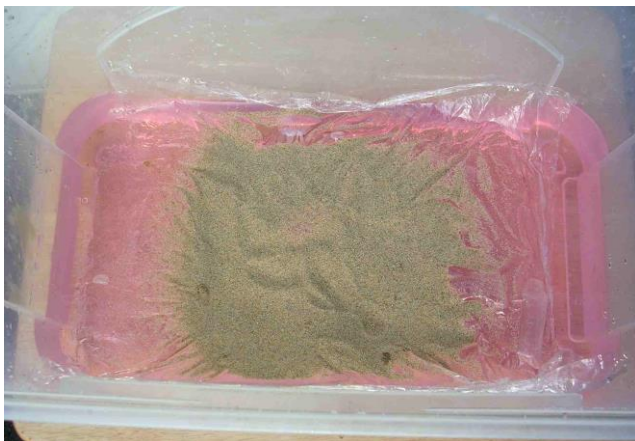
Photo 6: A layer of sand sprinkled onto cling film in water (top view)

Load structures may be modelled by floating a piece of cling film onto water in a small tank and sprinkling dry sand evenly onto it. The sand bulges downward into the water, resembling the shapes of load casts in rocks (Photos 6 and 7).