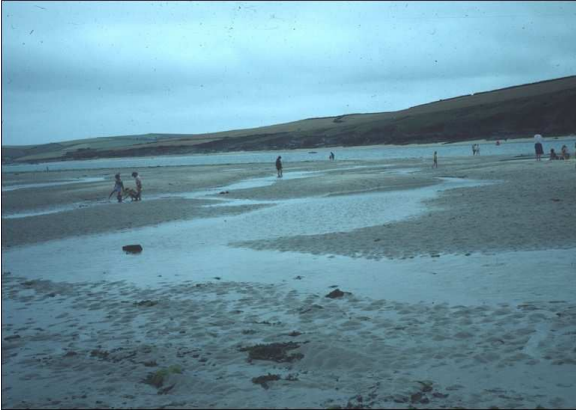
Photo 1: Subaqueous dunes formed on a beach; the dunes were formed by tidal currents flowing out to sea on a falling tide.

When water flows over loose sand, small-scale dunes can form like those shown in photograph 1.