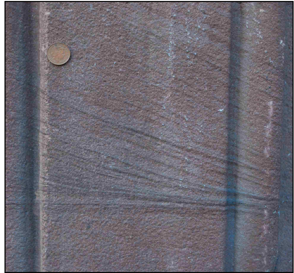
Photo 5: Red sandstone on the front of the same building (Coin = 2cm)