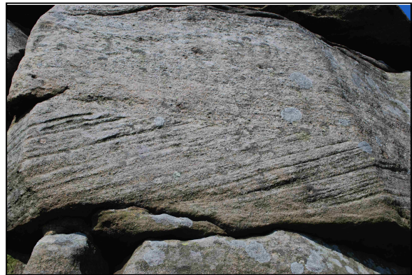
Photo 3: Cross bedding in a coarse sandstone, Burbage Edge, Sheffield

Now ask the class to say if the block of coarse sandstone in Photograph 3 is the right way up or if it is inverted. ( It is the right way up, since the truncation plane cuts sharply across above cross-beds ).