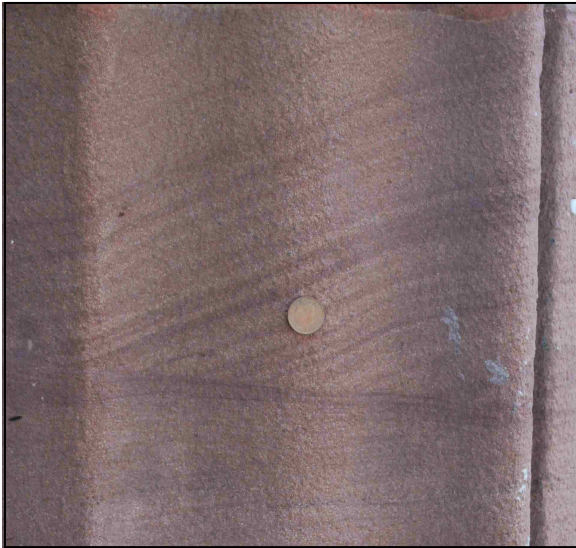
Photo 4: Red sandstone on the front of a building (Coin = 2cm)