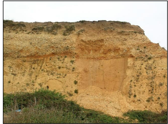
Landslide (at Barton-on-Sea, UK).