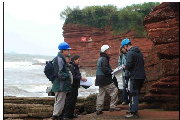
Rising tide, (Torbay, UK).