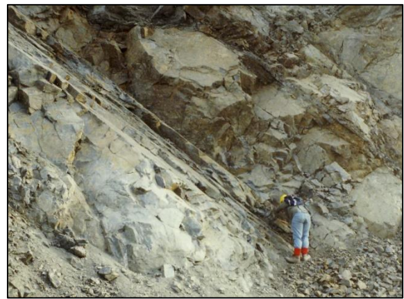
Overhanging rocks, Dolyhir Quarry, Wales, UK