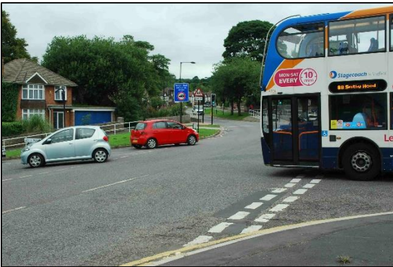
Road traffic (Sheffield), UK.