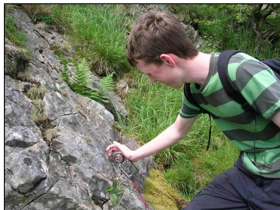
Measuring dip, (Ecton, Peak District, UK).