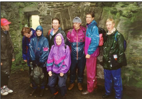
Exposure – very wet! (Isle of Kerrera, Scotland, UK).