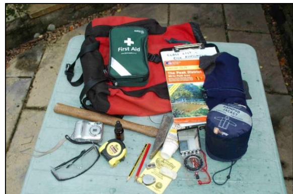
The leader's rucksack, with contents