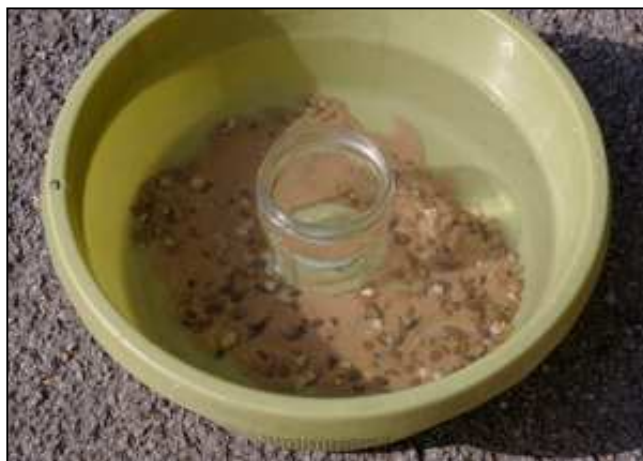
Sediment transport