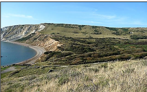
A ridge of chalk and a chalk cliff, with weaker rocks in the foreground, Tyneham Gwyle, Dorset, England.

The fine white limestone called chalk is so 'soft' that it can be used to write on a chalkboard or slate, but nevertheless, is tough enough to form high cliffs and ridges across the country. This is because, although the rock itself is readily broken apart, it has lots of cracks and fractures, allowing rainwater to drain through it quickly, so reducing the erosive effects of the water. Other 'soft rocks' can be similar.