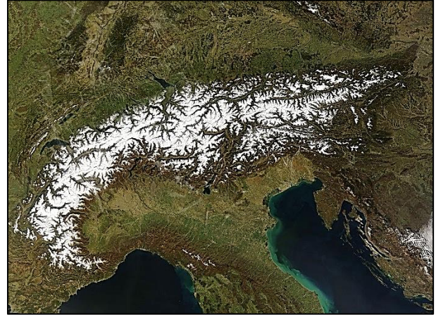
The high snow-covered Alps in Europe with older, often harder rocks, on either side.

One well-known example is the syncline which forms Snowden, the highest mountain in England and Wales.