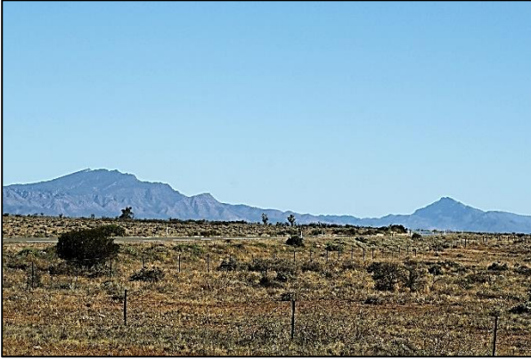
Inverted topography – the lower region in the centre is an eroded anticline, the higher region on the left is a syncline; Wilpena Pound in the Flinders Ranges, Australia.