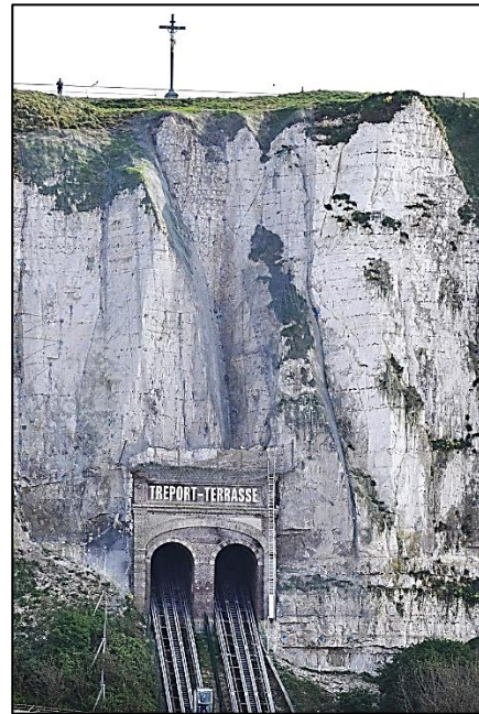
Railway tunnel into a chalk cliff, Le Treport, Normandy, France.