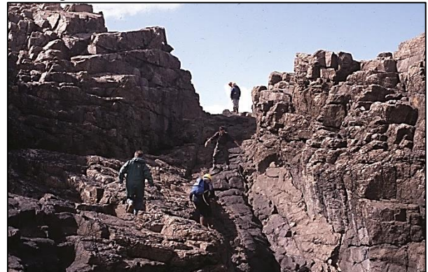
A weathered basalt dyke in tougher surrounding rock, Orkney, Scotland.

Although igneous rocks are usually very tough and resistant, and so make higher land, the minerals that make up darker-coloured igneous rocks can be less resistant to weathering and erosion than minerals in the surrounding rocks, so forming lower land.