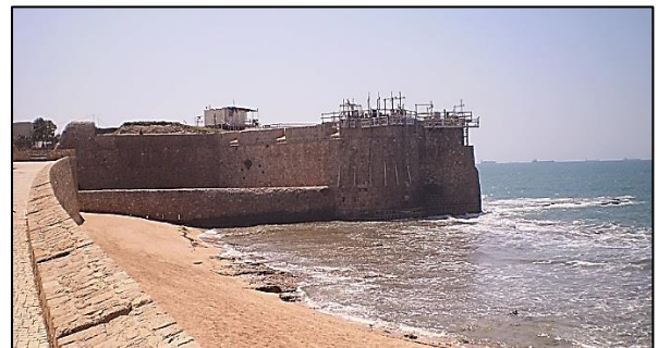
Sea wall and beach with no soil, Acre, Israel.

This image is in the public domain because it was solely created by NASA.