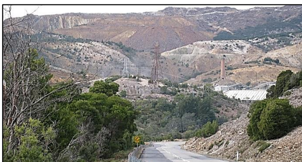
View near Queenstown, Tasmania, Australia, where much of the soil in the distance has been polluted by old mining and smelting (industrial) activity.