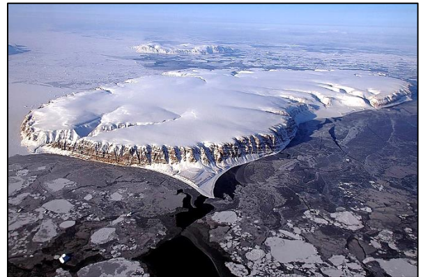
The ice cap covering Saunders Island, Greenland, where there is no soil.