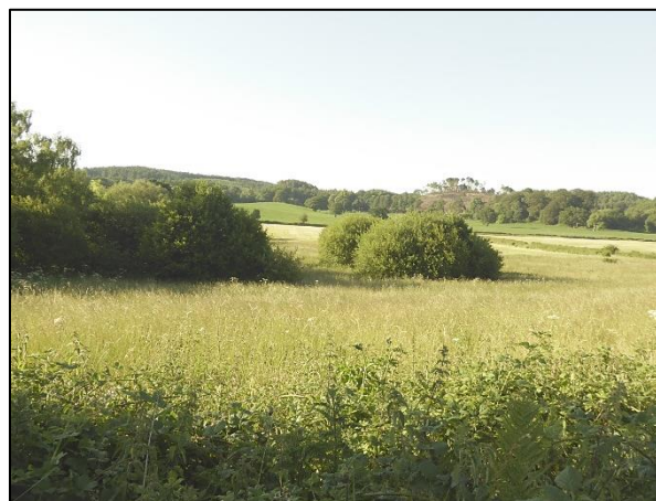
The field in Shropshire, England, where Charles Darwin ‘discovered’ how soil forms (see the ‘Darwin’s ‘big soil idea’ Earthlearningidea) (Chris King).

See the list of other Earthlearningideas for teaching about soils at: https://www.earthlearningidea.com/home/Teaching_strategies.html#soils , including how Charles Darwin ‘discovered’ how soil forms.