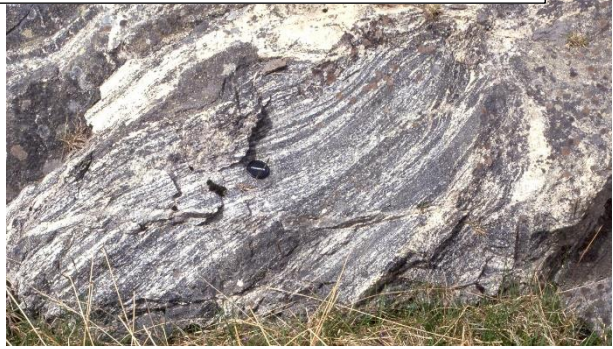
F. Rock exposure. Height of section c 1.5m