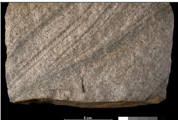
K. Hand specimen of a rock that does not react with acid