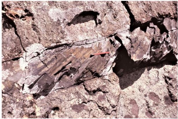
H. Rock exposure. Width of view c.1.5m