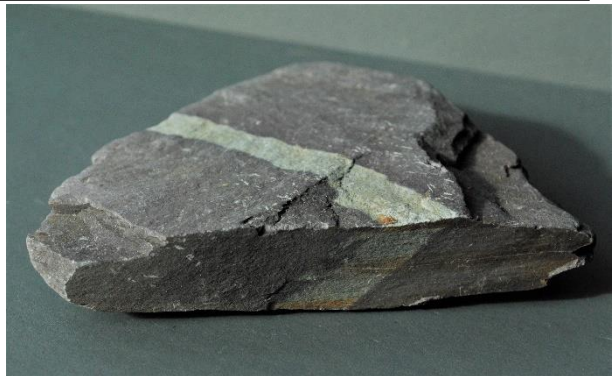
J. Hand specimen. Width of specimen c.10cm