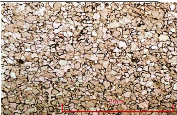
I. Magnified rock slice of a carbonate rock. Width of view c.3mm