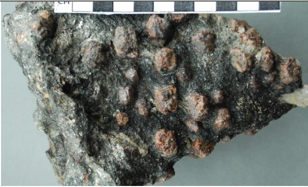
E. Hand specimen with smaller aligned crystals around large crystals.