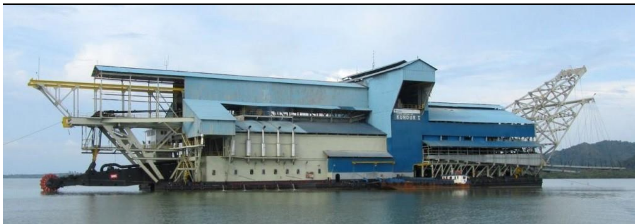
Fig 3. A tin dredger in Indonesia