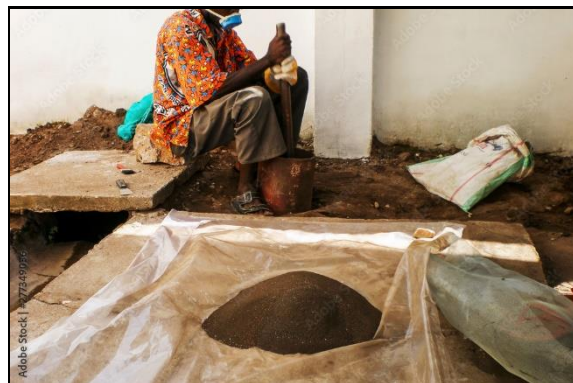
Fig 2. An artisanal miner in the DR Congo grinding coltan ore by hand

Mining is carried out on all scales from vast mechanised mines to very small-scale ones: some of these are licensed, but many are illegal. The small mines are worked by local people, known as artisanal miners, under dangerous conditions and with little return for their money.