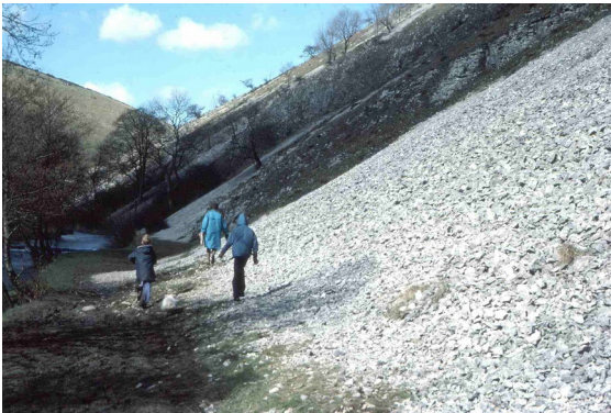
Photograph 1

Show the pupils the photographs on this sheet and invite them to match the pictures to a) the descriptions and b) the explanations of the weathering processes.