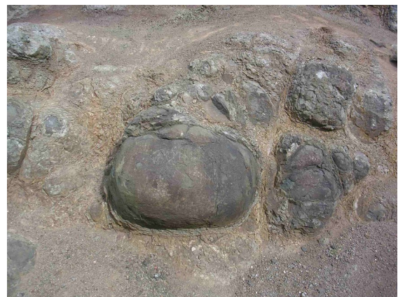
Photograph 5 (Height of section about 3m)