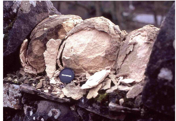
Photograph 4 (The lens cap is 50mm across)