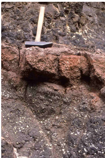
Photograph 9 (The hammer is 40 cm long)