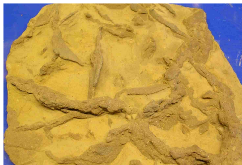
Mudcracks in a sedimentary rock 250 million years old

You can compare your cracks produced in the classroom with those seen in ancient rocks, as in the photo below. These are caused by shrinkage due to drying.