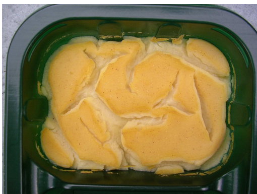
Cracks in dried out maize flour porridge.

The results are very variable, but within about half an hour or so, the surface of the mixture cools and shrinks. As it does so, it cracks into a range of shapes on its upper surface. Shrinkage continues as the mixture dries out, over several days, usually producing more cracks. Many of these are deep enough to cut through the whole mixture.