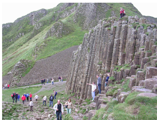
Polygonal columns in a thick lava flow. Giants' Causeway, Antrim, Northern Ireland

Other forms of polygonal cracks occur in thick lava flows. In the best known cases, these form gigantic columns, many metres in height. The process of formation of these is different from that of mudcracks. These columns have formed as molten lava cools, solidifies and contracts. So these cracks form by contraction during cooling, not shrinkage by drying out, as in the mudcracks. The result of the contraction-cooling in lavas is called columnar jointing .