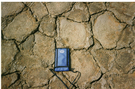
Polygonal cracks in mud on a dried out lake bed in England

Your pupils may have noticed that, when a pool dries up, it often leaves a muddy bed, which cracks into regular shapes (polygons) as the wet mud shrinks.