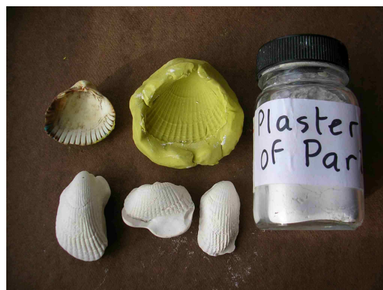
The materials needed for the activity and three 'fossils' produced by varying forces of distortion.

here are unlikely to cause any problem. Do not wash surplus plaster down sinks, as it might block them.