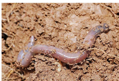
A close up image of an earthworm.

Permission is granted to copy, distribute and/or modify this document under the terms of the GNU Free Documentation license.