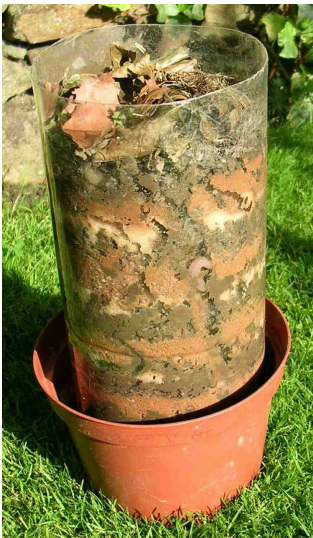
The 'Do-it-Yourself' wormery after 6 days.

Context: Pupils are asked to think through how soil forms, as Darwin did in the 1830s, then to suggest how he could have tested his ideas. They then are invited to either build their own wormery or observe one that a teacher has built. Our wormery developed as follows over several days.