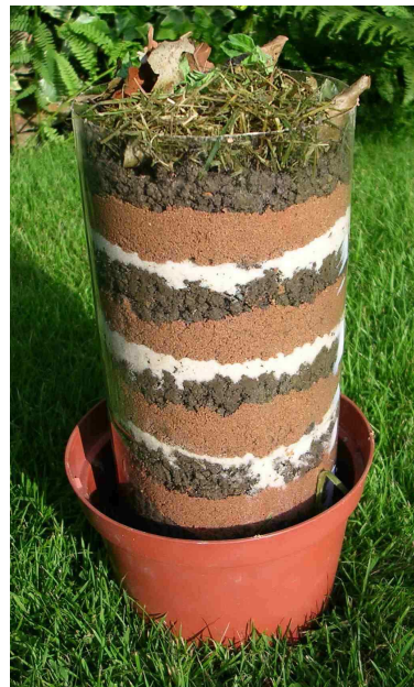
A 'Do-it-Yourself' wormery.

Try building your own wormery like this one: