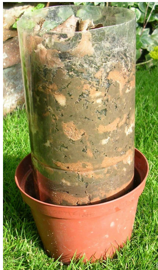
The 'Do-it-Yourself' wormery after 15 days.

wormeries with different layers of sand, soil, chalk, organic material (grass, leaves, vegetable peelings, etc.) to see how the action of the worms affects the layers.