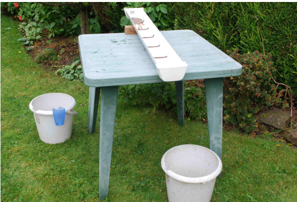
The gutter set up on a wooden block ready for action

When the pupils have made their suggestions, show them a length of gutter with thin baffles (low barriers) glued across it, a block of wood and a bucket of water. Ask them how this equipment could be used to separate the 'gold' from the sand. Follow the pupils' suggestions in a demonstration. Then, if they have not thought of it for themselves, show how it may be done. Rest one end of the gutter on the wood block and let the other end drain into a bucket. Add about 50ml of the sand/'gold' mixture to the top of the gutter and then very gently trickle water down over it, from a jug. The less dense sand washes over the baffles and comes to rest in the lower end of the gutter, but most of the dense 'gold' remains trapped behind the top two or three baffles. This process happens in real rivers, where gold and ores of other dense metals settle out behind obstructions on the river bed.