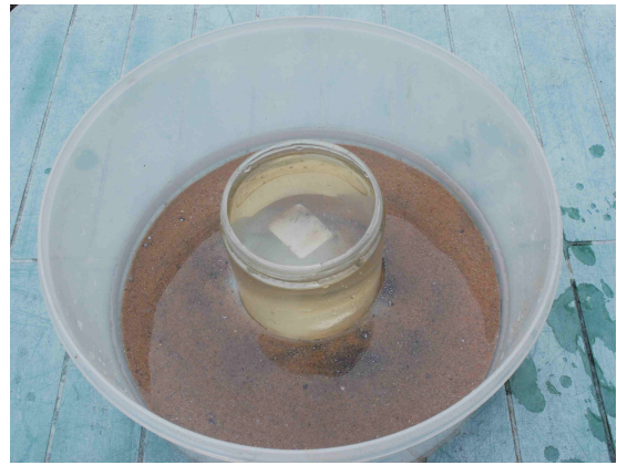
The 'continuous river bend' model set up with an even layer of sand and dense ore

The second demonstration models a bend in a river, but here it is a continuous bend! Pour about 10cm depth of water into a round flat-bottomed bowl. Place a round object in the middle of the bowl, to represent the inner bank of a meander. Sprinkle about 75ml of the sand/'gold' mixture evenly onto the base of the bowl and jiggle the bowl slightly to even out the layer. Using a dessert spoon or similar object, gently stir the top 2 cm or so of the water round and round, for a few minutes until the sand moves along the bed to form shapes. (Do not stir the sand itself). The 'gold' settles out behind the newly formed ripple marks, whilst the sand keeps sweeping over the crest of each ripple mark. Where the current is fastest, on the outside of the bend, the sand may be swept clear, leaving behind the dense 'gold'.