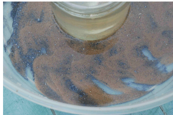
Ripple marks formed in the sand, with the dense ore trapped behind each ripple

Ores which become concentrated in moving water, as in these two activities, are referred to as placer deposits .