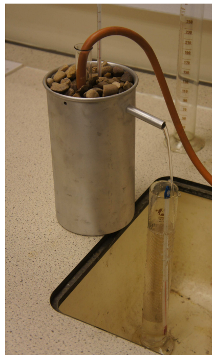
The geothermal power model 'in action'

Finally, discuss the proposition, found in many science textbooks, that 'geothermal energy is renewable'.