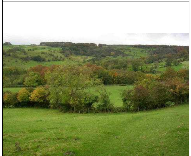
Plants using CO 2 in photosynthesis