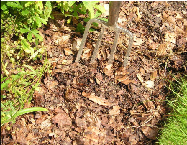
Decaying leaves