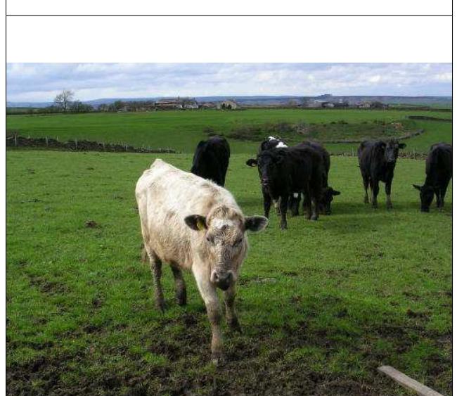
Animals eating plants