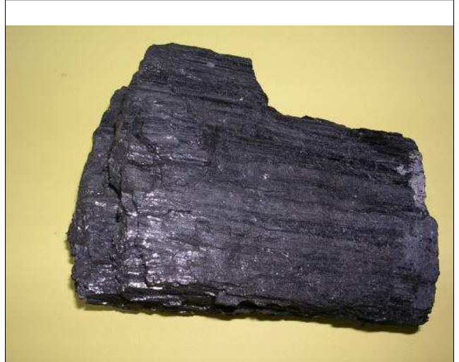
Coal - fossil fuel