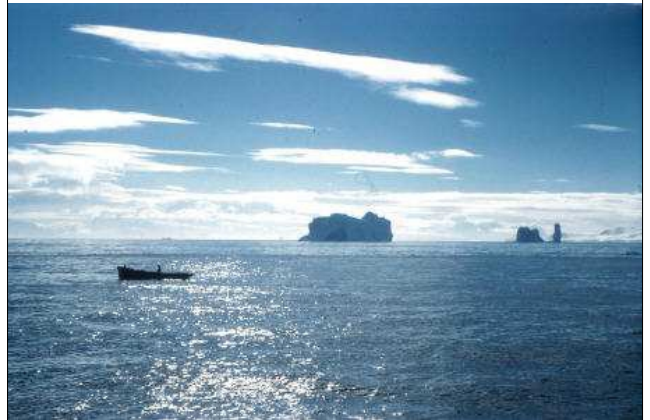
Ocean uptake of CO 2