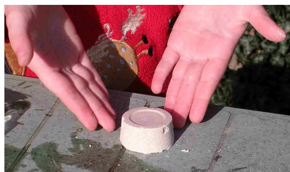
c) the result – a lovely smooth 'rock'!