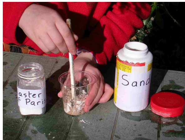
The 'kitchen table' version:- a) Mixing the damp sand and plaster