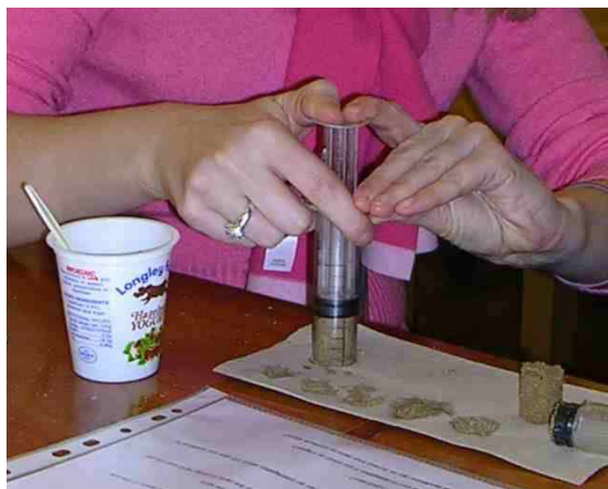
Making a 'rock' pellet in the lab using a sawn-off syringe

Many sedimentary rocks were once loose sediments that were cemented by natural cements in a very similar way. Natural cements were deposited by fluids flowing through the spaces between the grains.