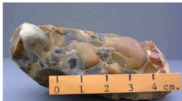
Conglomerate – a rock made of rounded pebbles cemented together naturally. The cement in this case is silica, which is very hard.