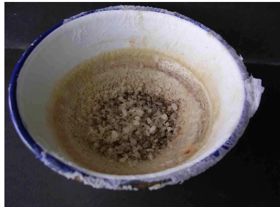
Crystals formed by the slow evaporation of sea water (Extension)