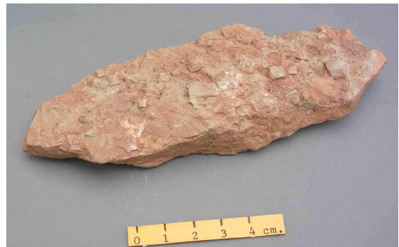
Salt pseudomorphs. These cubic shapes were formed on an ancient salt flat, which dried out to leave salt crystals. The next flood of water dissolved the salt and washed clay into the cubic shapes. This then hardened to give the shapes you can see.