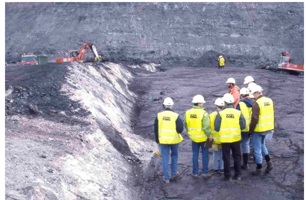
A normal fault in an opencast coal mine. The students are standing on a coal seam which has been dropped down by about 2 m along the grey coloured fault plane, compared to the same seam higher upon the left.

There will be some avalanching of sand grains next to the board, which is of little significance. However, a clear break will usually occur a few centimetres away from it, where the layers of sand on one side slip down in relation to the rest of the layers in the box (as in the photographs). The plane along which this slippage occurs is known as a normal fault plane. This is typical of situations where rock masses are being pulled apart and the rocks on one side slip downwards under gravity.