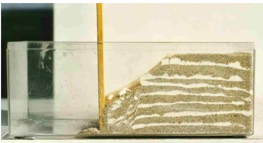
Successive stages in producing a normal fault – and a 'rift valley'

There will be some avalanching of sand grains next to the board, which is of little significance. However, a clear break will usually occur a few centimetres away from it, where the layers of sand on one side slip down in relation to the rest of the layers in the box (as in the photographs). The plane along which this slippage occurs is known as a normal fault plane. This is typical of situations where rock masses are being pulled apart and the rocks on one side slip downwards under gravity.