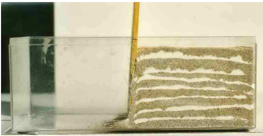
How to set up the box

Make a valley – by using the empty plastic box from the 'The Himalayas in 30 seconds!' activity in a different way – this time by pulling 'rocks' apart. Place the vertical board about half way along the box and ask someone to hold it there or place a small block behind it. Build up layers of dry sand and flour on one side of the board only, nearly up to the top of the box, as in the first photograph. (Any powder with a different colour from the sand may be used for the alternate layers. The powder need only be added to the front of the box, which the pupils will watch).