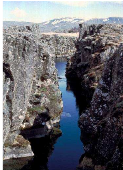
A narrow rift valley in Iceland. The sides of the gorge have been pulled apart , and are not due to erosion by a river.